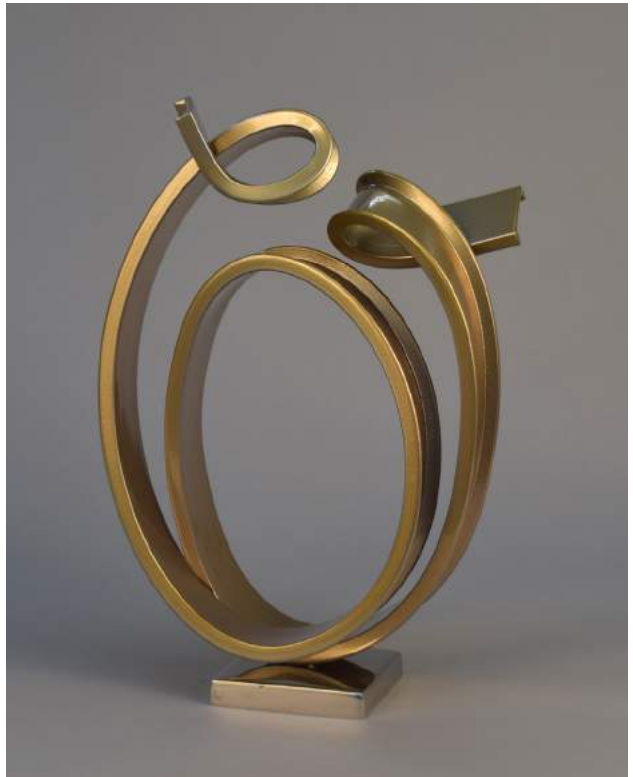
GIVE AND TAKE (2015)