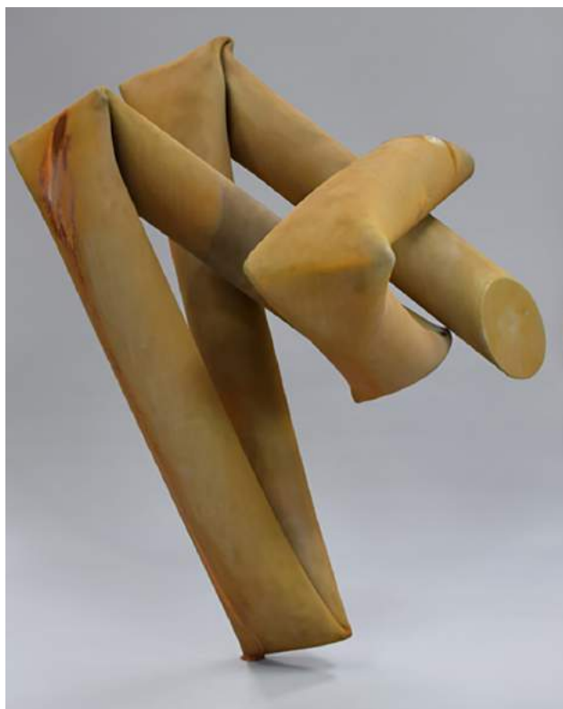
LOVE STRUCK (2022)