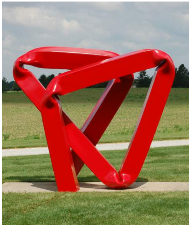
ZIG ZAG (2011)