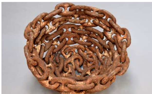
BOWLED OVER (2018)