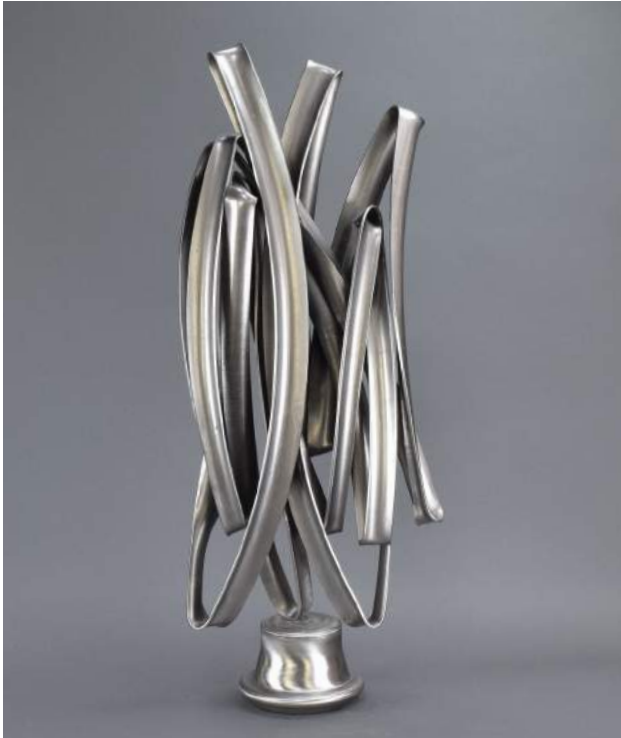
MEETING UP (2022)