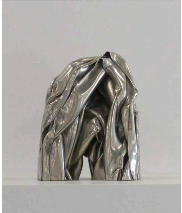
SCHOLAR STONE RED, (2023)