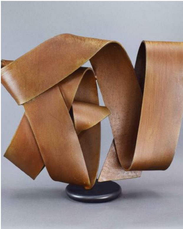
TURN ABOUT (2022)